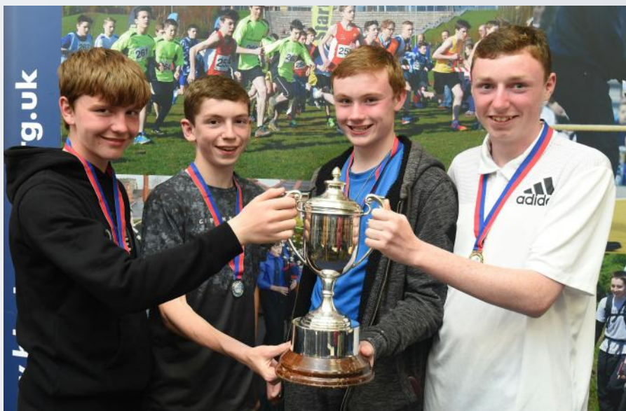
2 East Kilbride, Overall winners of The Kilbride Hike